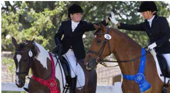
RAAC. Regional Adult Amateur Competitions for Amateurs to compete in Novice or Elite Divisions within their Region, North, Central and South.

Dressage (training or schooling) is an equitation term that means the gradual harmonious development of the horse's physical and mental condition with the aim to achieve the improvement of his natural gaits and perfect understanding with his rider.