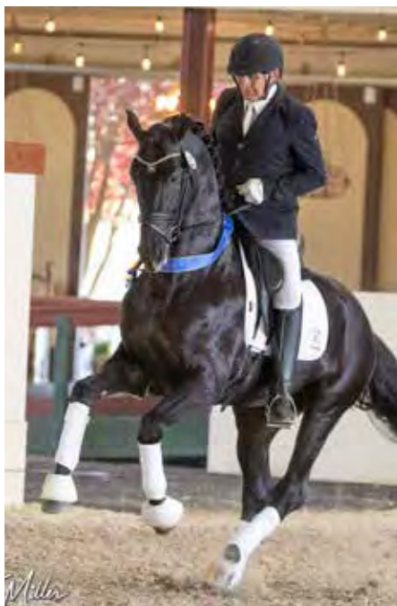
WILLY ARTS / SERUPGAARDS ~ CEZANNE KELLY MYKRANTZ / NAVANNAH 4 YEAR OLD FUTURITY