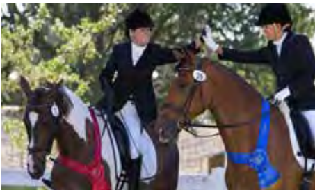
RAAC. Regional Adult Amateur Competitions for Amateurs to compete in Novice or Elite Divisions within their Region, North, Central and South.

Dressage (training or schooling) is an equitation term that means the gradual harmonious development of the horse's physical and mental condition with the aim to achieve the improvement of his natural gaits and perfect understanding with his rider.