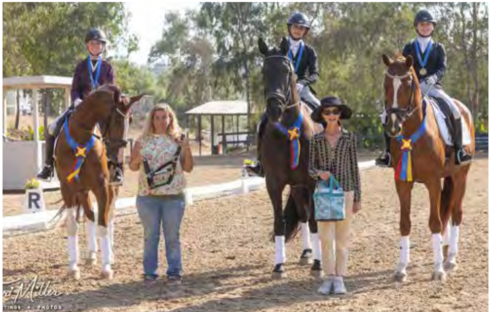
TEAM COMPETITIONS SOUTHERN JR/YR CHAMPIONSHIPS