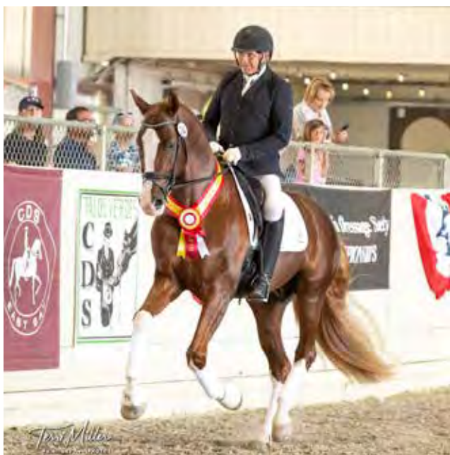
WILLY ARTS / OSCAR CDS CAL BRED