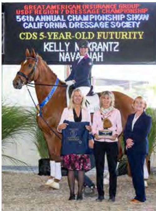
5 YEAR OLD FUTURITY