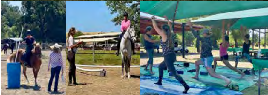
Annual Awards Banquet & Adult Amateur Camp

For more information about our Chapter and events, visit us at www.svccds.org and follow us on Facebook and Instagram: Sacramento Valley Chapter of the California Dressage Society