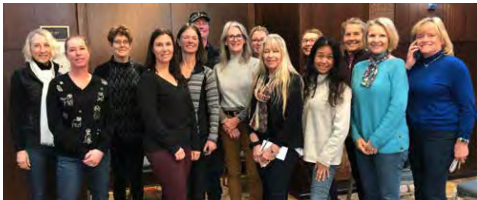
CENTRAL REGION CHAPTERS: CEN, DS, EB, GAV, SC, SLO, SBC, TEH, VE