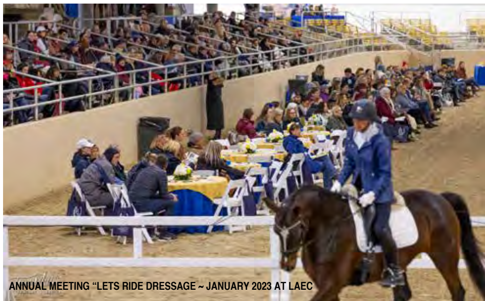
ANNUAL MEETING "LETS RIDE DRESSAGE ~ JANUARY 2023 AT LAEC

SCRATCHES – REFUNDS – EXPECTATIONS - DISAPPOINTMENTS Unfortunately, competitors sometimes have to cancel. Each show sets its own refund policy; read that policy before you enter the show. A Veterinary or Doctor's excuse may suffice for a full or partial refund, BUT IT IS NOT GUARANTEED . Shows set their schedule, number of arenas, number of judges, etc. on the day entries close. If you scratch after that date, you have essentially purchased time in the show. Stabling may be non-refundable.