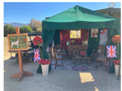
Previous winner, Sandy Savage Dressage